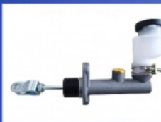
Clutch Master Cylinder